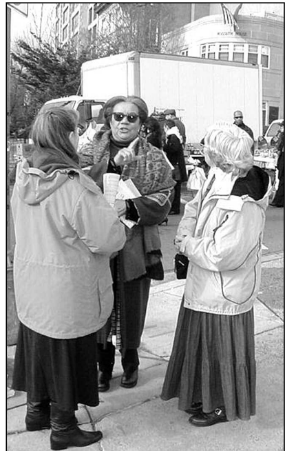
CEASE members dialoguing with Marian Wright Edelman at Dupont Circle Farmer’s Market.